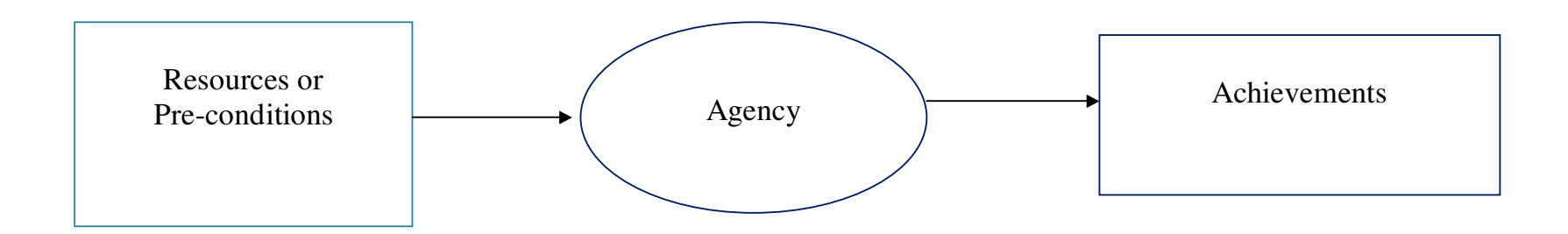
Figure 1: A conceptual framework for Empowerment (Personal elaboration from Kabeer, 1999)