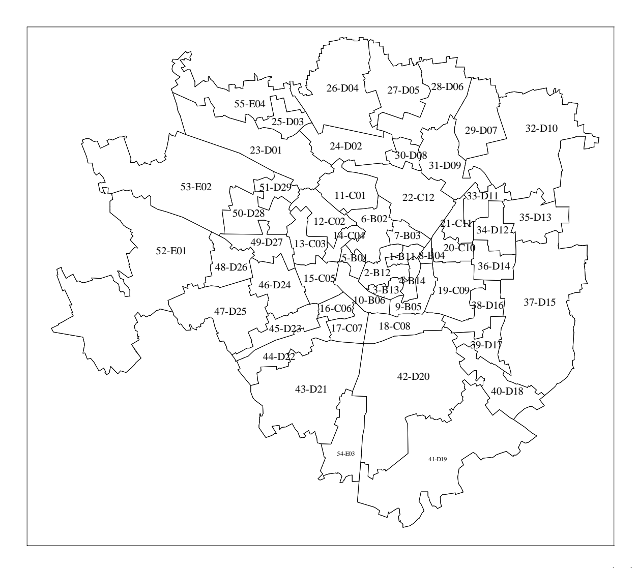
Table A1 (cont.): List of districts in Milan - Suburbs